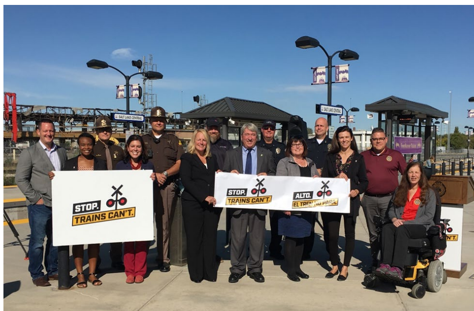
Utah Rail Safety Week press conference on September 23, 2019.