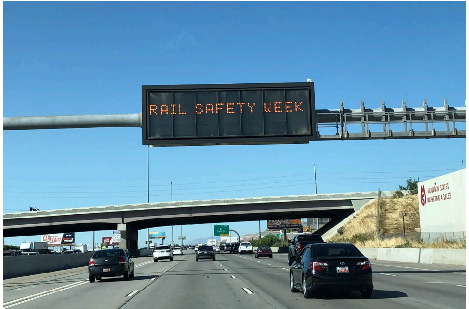
Message Monday on UDOT's variable message boards on September 23, 2019.

Operation Clear Track Law Enforcement coordinated effort with the Utah Highway Patrol, Utah Transit Authority Police Department, and Union Pacific Special Agents from 7:00 a.m. to 9:00 a.m. at the 300 North in Salt Lake City and 2100 South in South Salt Lake City railroad crossings. Other law enforcement agencies participating included Pleasant Grove PD, Price PD, Roy PD, University of Utah PD, Utah Highway Patrol, and the Utah Transit Authority PD.